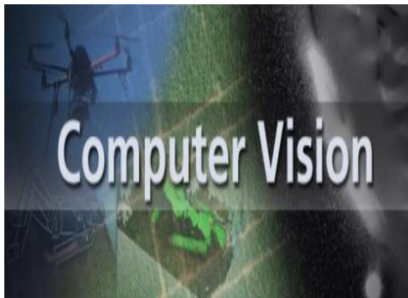
Fig. 1: 3-d computer vision image