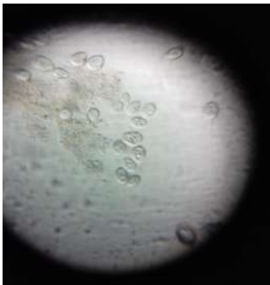
Fig 5: Protozoa