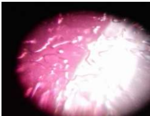
Fig 6: Plant tissue