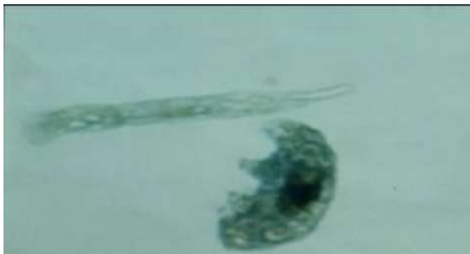
Fig 2: Tardigrades (Water bear)