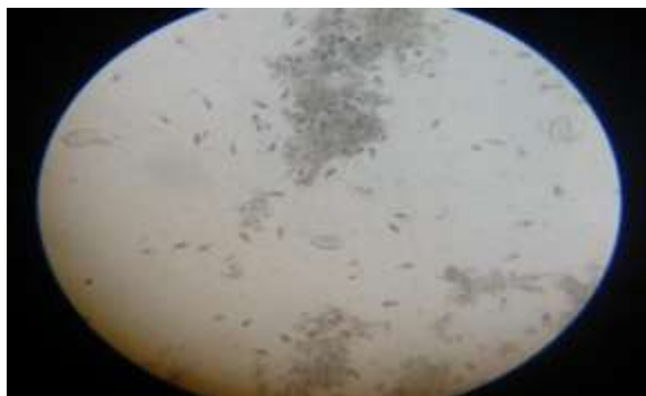
Fig 4: Protozoa