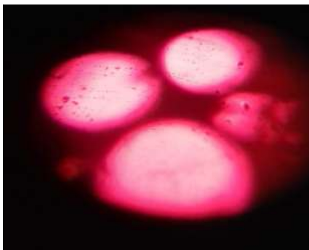
Fig 7: Plant tissue