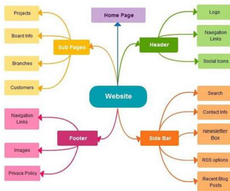
Figure1.Creately for education

Education is basically an economic wellbeing quo that has comparing hyperlinks with elective social foundations political, monetary, family, and strict of society. Not altogether this, preparing and opportunity social foundations meaningfully affect