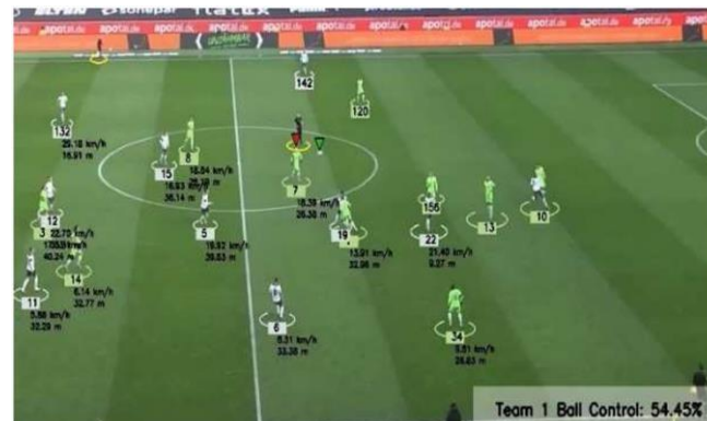
Fig. 3. YOLOv5-Based Object Detection and Tracking Results