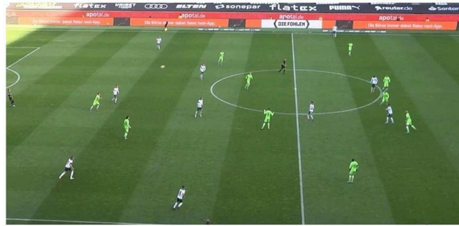
Fig. 2. Sample Input Frame from a Football Match Video