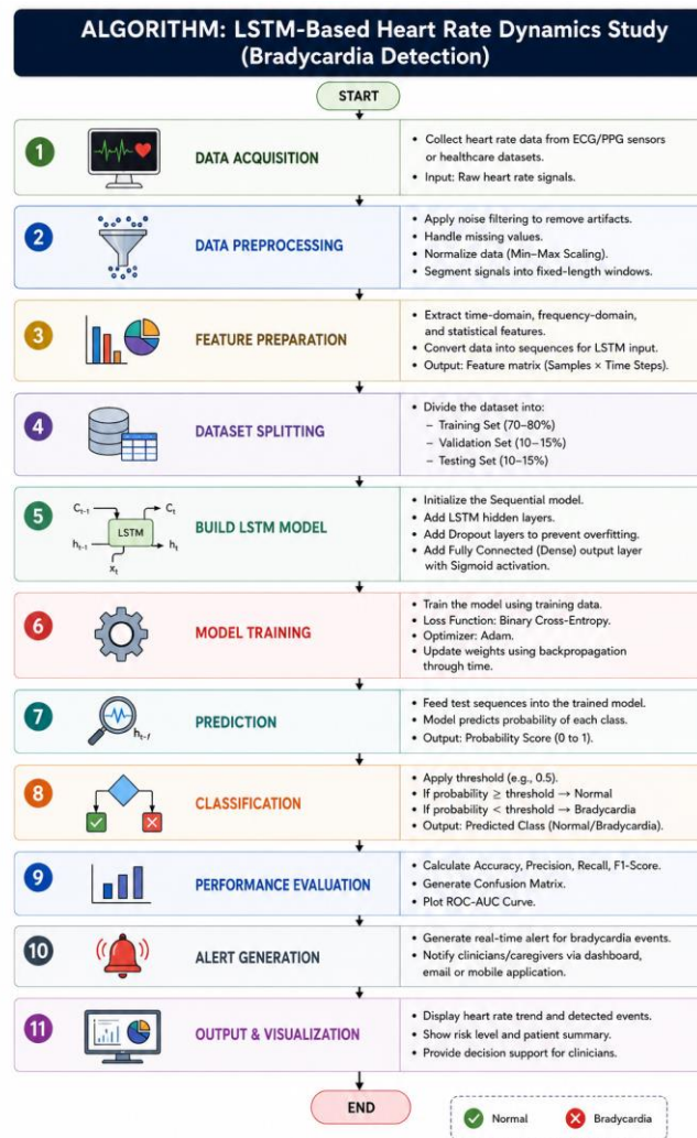
Figure – 2 – Algorithm

Display prediction results and alert for bradycardia conditions.