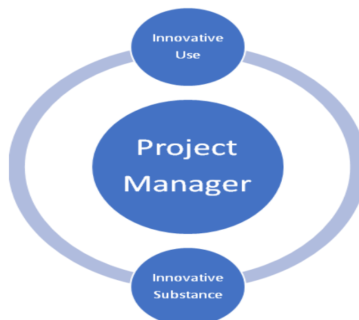
Figure 1: Innovative Use & Innovative Substance in Project Management

We schematize these two kinds of innovation in the next figure: