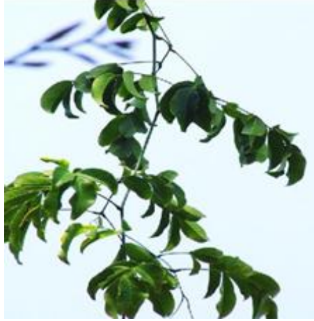
Image of the plant Entada rheedei Spreng