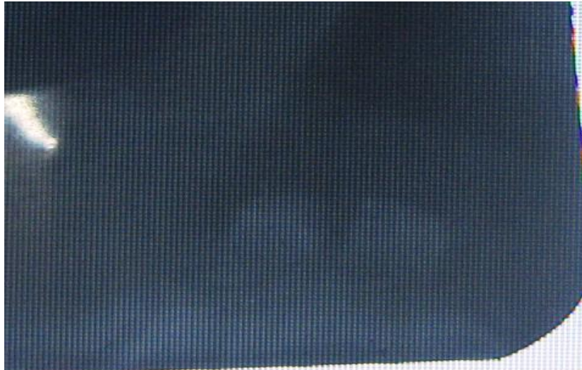
Figure 4: B IOPA X Ray showing two teeth