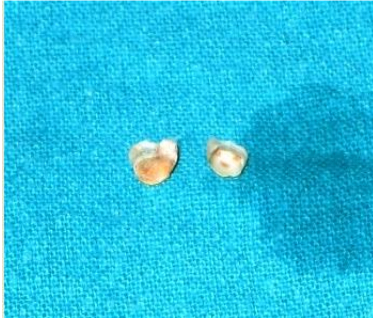
Figure 3: Extracted shell shaped natal teeth without root formation.

A fifteen days old baby boy was brought to the clinic by his parents with the complaint of two erupted lower front teeth since birth. On the intraoral examination, two mandibular anterior teeth were found. The teeth were excessively mobile and at the verge of fall. So, the teeth were extracted immediately under topical anaesthesia (Fig.3).