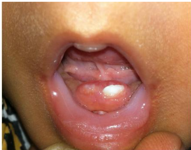
Figure 4: C Erupting natal tooth of third quadrant.