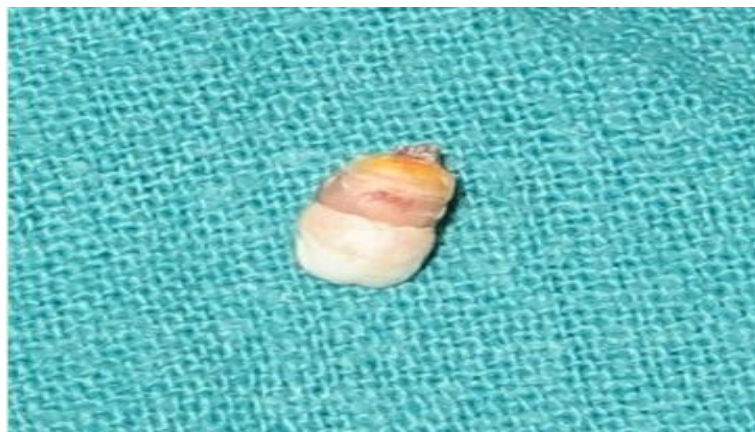
Figure 2: B Extracted natal tooth with very little root formation.