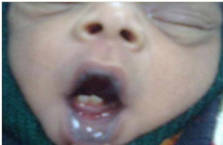
Figure 1: A Clinical view of natal teeth in oral cavity.

After applying topical anaesthesia to the adjacent gingiva, a piece of gauge placed lingual to the natal teeth to prevent the aspiration, teeth were extracted (Fig.1B).