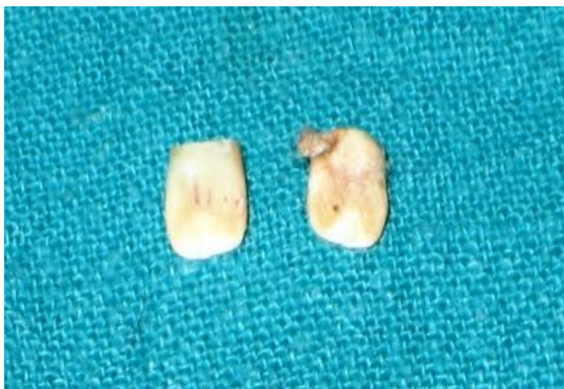
Figure 4: D Extracted teeth.