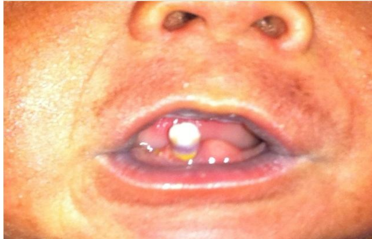
Figure 2: A Clinical view of natal tooth with gingival swelling adjacent to it.

A twelve days old baby girl was brought to the clinic by her parents with the complaint of one erupted lower front tooth since birth. Intraoral examination revealed a single mandibular anterior tooth (Fig.2A). Another tooth was palpable over the alveolar mucosa (Fig 2A). The tooth was excessively mobile and caused discomfort to the baby while feeding. Ulceration of the tip of tongue was also present. So, the mobile tooth was extracted under topical anaesthesia (Fig.2B). The Tooth below alveolar mucosa was left untouched (Fig2C).