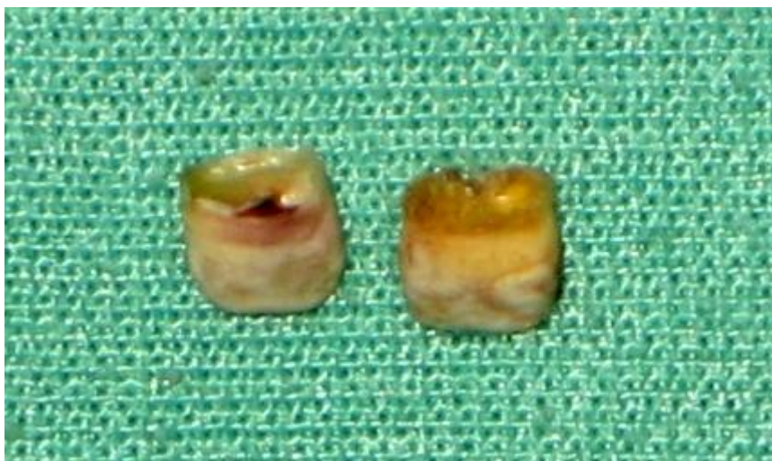
Figure 1: B Extracted Natal teeth showing shell shaped crown with no root formation. Teeth are yellowish in colour with hypoplastic enamel and dentin.