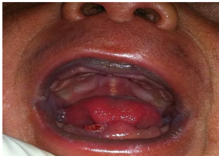
Figure 2: C Post extraction view.