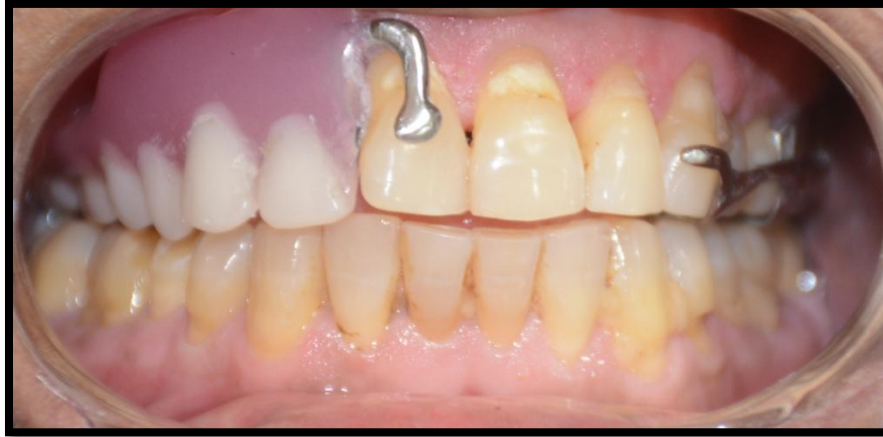
Fig. 8a: Insertion of the Finished Prosthesis