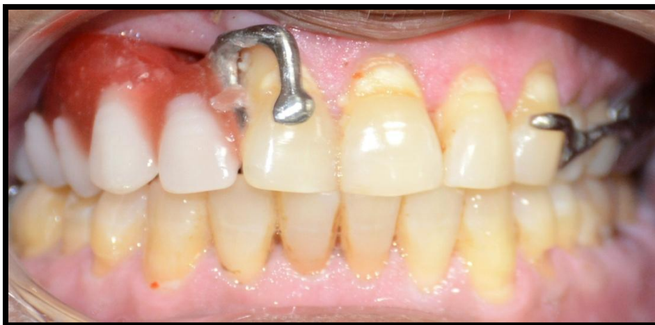
Fig. 7a: Wax Try-In