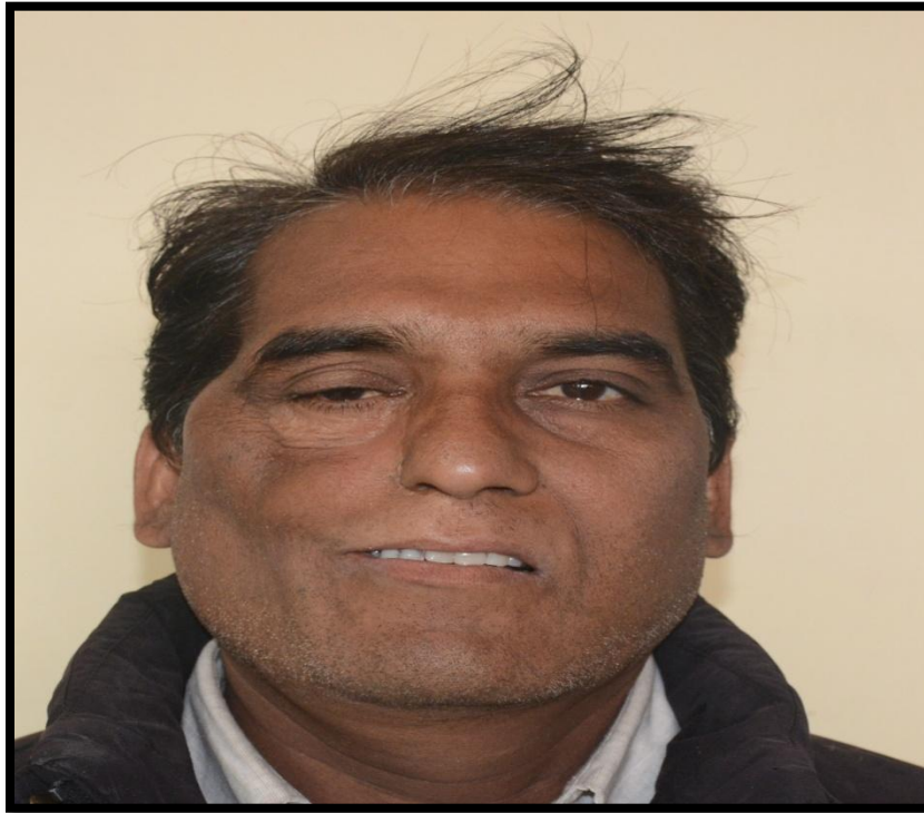
Fig. 10: Post RPD Insertion Extra Oral Frontal View