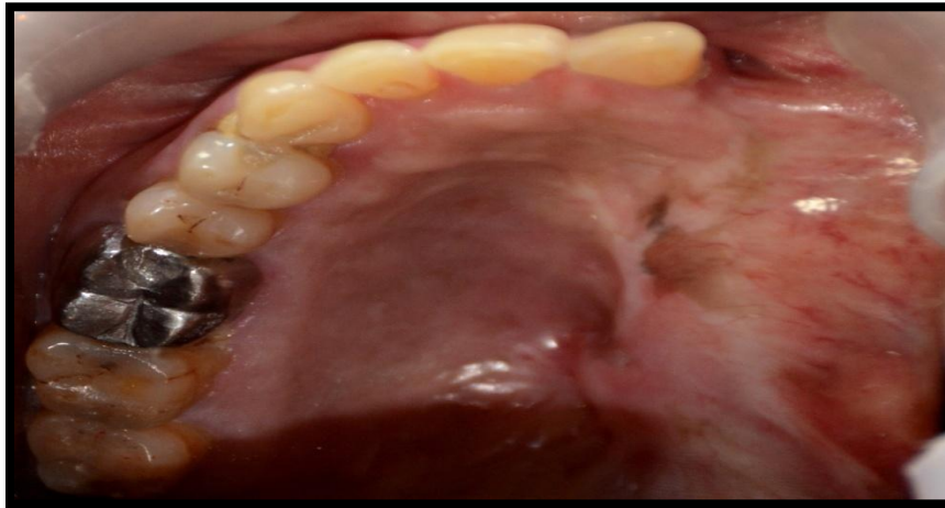
Fig. 3: Intraoral View after Mouth Preparation

• Mouth preparation was done (Fig 3). Border molding was done towards the defect side and final impression was made with polyvinylsiloxane impression material (Affinis, Coltene Whaledent) (Fig 4) and master cast was then poured in die stone (kalabhai, Ultrastone). Wax pattern was adapted on refractory cast and casting of metal framework was carried out(Fig 5). Trial of finished and polished framework and needed adjustments were done (Fig 6)