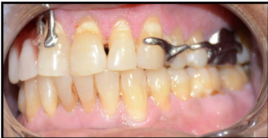
Fig. 7b: Wax Try-In