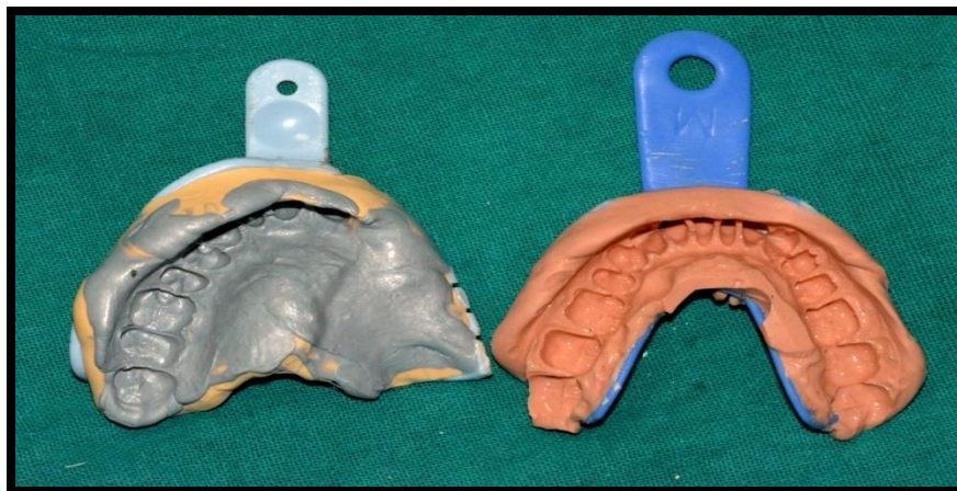
Fig. 4: Final Impression, Putty with Light Body