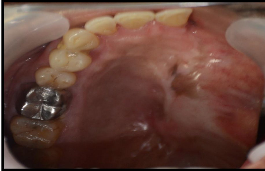
Fig. 1: Pre-Operative Intraoral View

A 45 years old male patient was referred from Oral & Maxillofacial Surgery department with a history of partial maxillectomy 6 month back to the Prosthodontics and Crown & Bridge department for prosthetic rehabilitation (Fig 1).