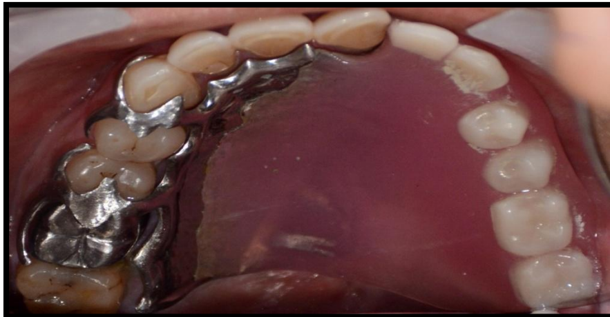
Fig. 8b: Insertion of the Finished Prosthesis