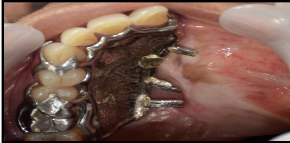
Fig. 6: Framework Try In