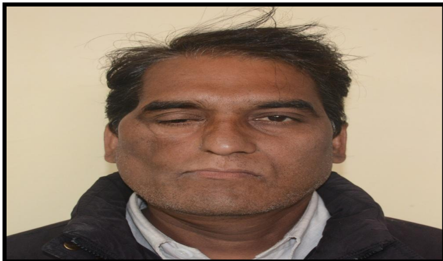
Fig. 9: Pre Operative Frontal View