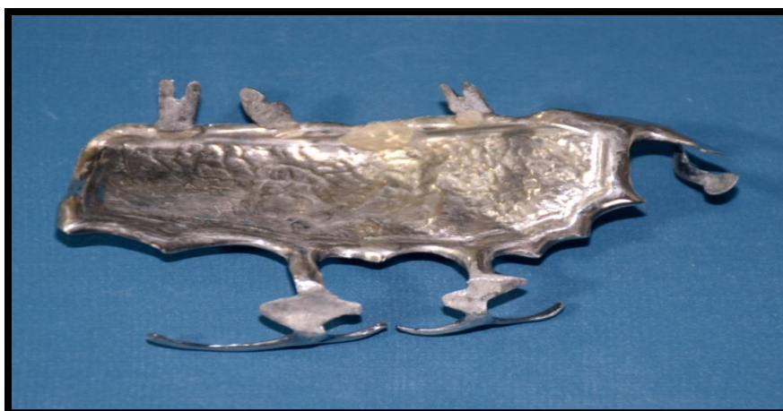
Fig. 5: Cast Partial Framework Obtained After Casting