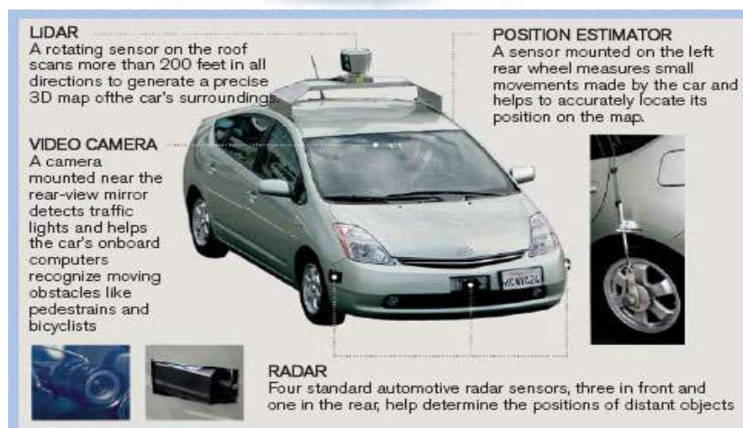
Fig 4 showing various components of driverless car

Another challenge to mass proliferation is limitations with sensors. A driving demonstration of an experimental autonomous Mitsubishi Outlander failed to warn the occupant sitting in the driver’s seat of unaware pedestrians or motorcycles in the car’s blind spot. Another time its “Caution, Oncoming Vehicle” buzzer sounded an alert to pedestrians, but it was tough to pinpoint which vehicle among several the warning was coming from. Nissans such as its experimental autonomous Leaf – shown in a positive report from another event below – could get around some issues by being equipped with multiple radar sensors, lasers and cameras to monitor surroundings and plot the car’s course.