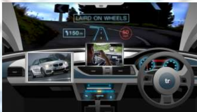
Fig 2. Preloading of route map and speeding instructions from GPS

With demand for advanced in-car navigation and entertainment systems growing, vehicles are becoming ever better connected. From next year cars sold by GM in the United States and Canada will come with fast 4G mobile broadband. Improved connections will also make it possible for cars to send hazard warnings to each other, to receive a constant stream of information on the traffic and weather ahead and even to interact with signals as they approach junctions.