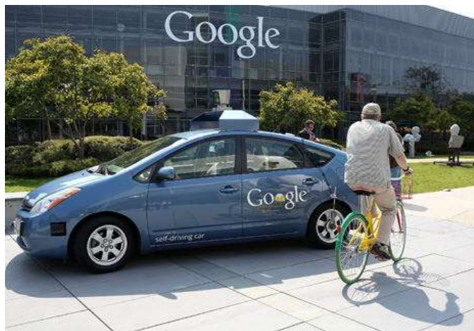
Fig 1. Google first revealed driverless car in 2010

With demand for advanced in-car navigation and entertainment systems growing, vehicles are becoming ever better connected. From next year cars sold by GM in the United States and Canada will come with fast 4G mobile broadband. Improved connections will also make it possible for cars to send hazard warnings to each other, to receive a constant stream of information on the traffic and weather ahead and even to interact with signals as they approach junctions.