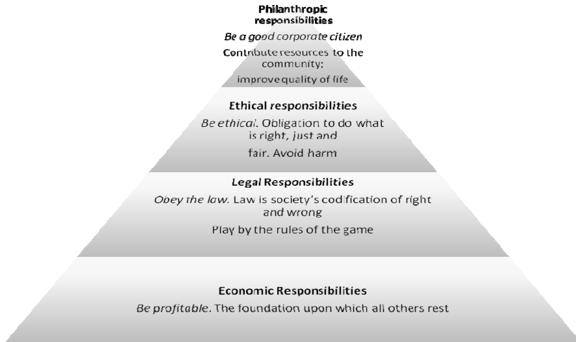
Figure 1: The Pyramid of Corporate Social Responsibility,