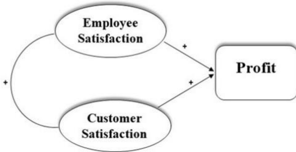
Figure 1: Employee Satisfaction in terms of profit

The satisfied and loyal employee works in a way that decreases the cost of company such as operating cost and production cost. This can leads towards profitability. Correspondingly the satisfied customer can encourage other people to refer to the same bank, called “word of mouth” which leads organization to profits. These processes are like a chain that will bring profitability for organization, especially banks.