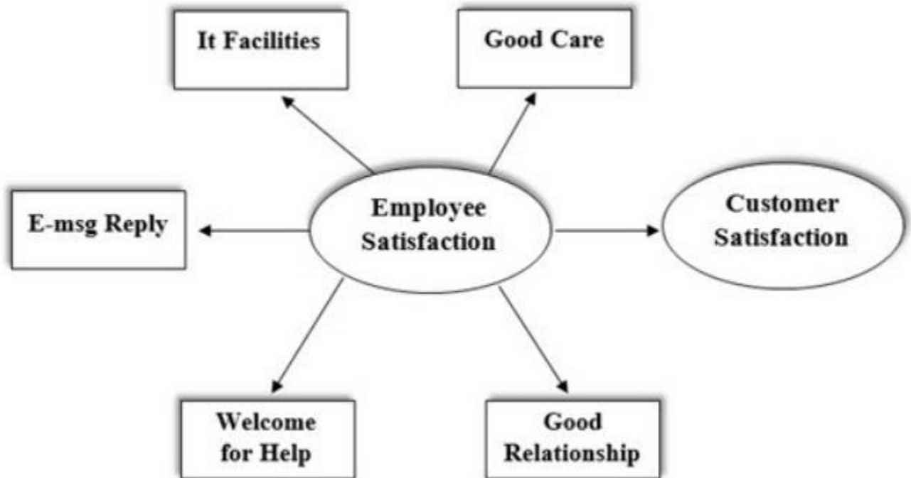
Figure 2: Employee Satisfaction Impact on customer satisfaction