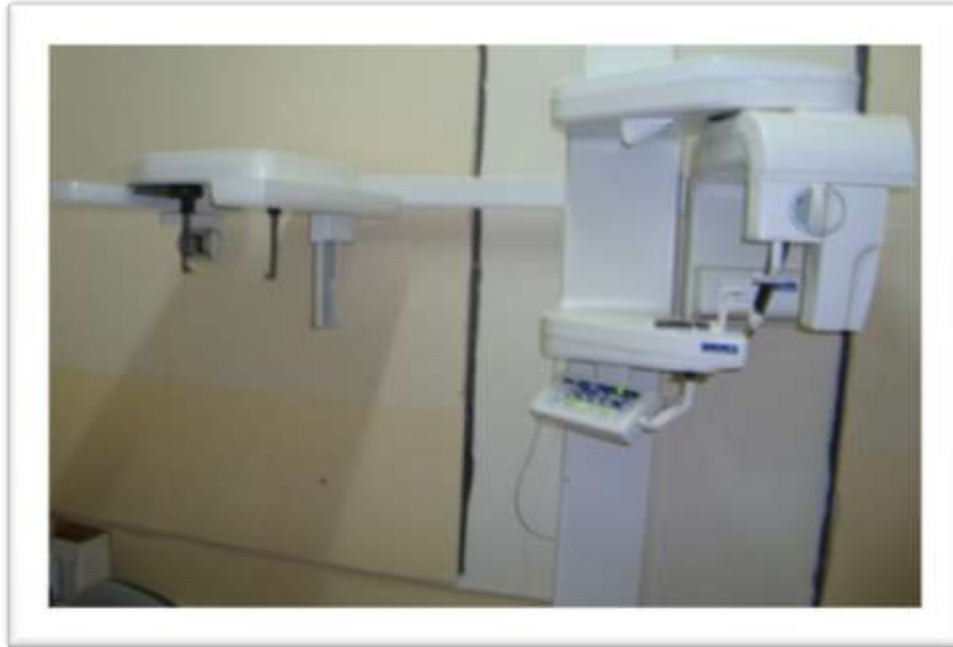
Figure (1): Digital Cephalometric Machine