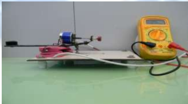
Fig 1. Frictiometer