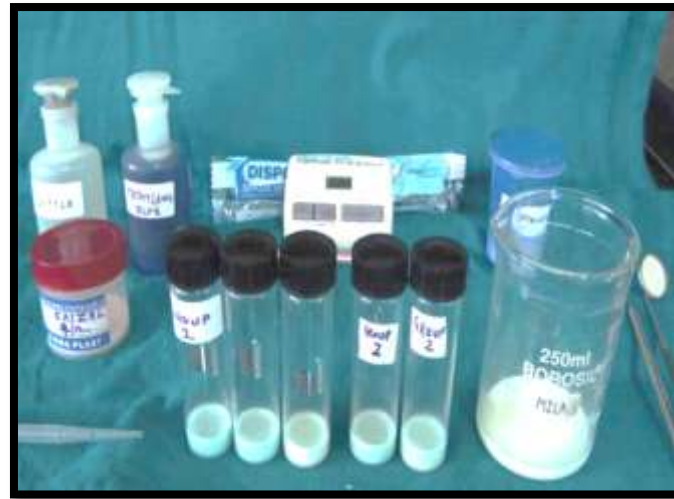
Figure 1 – Armamentarium used