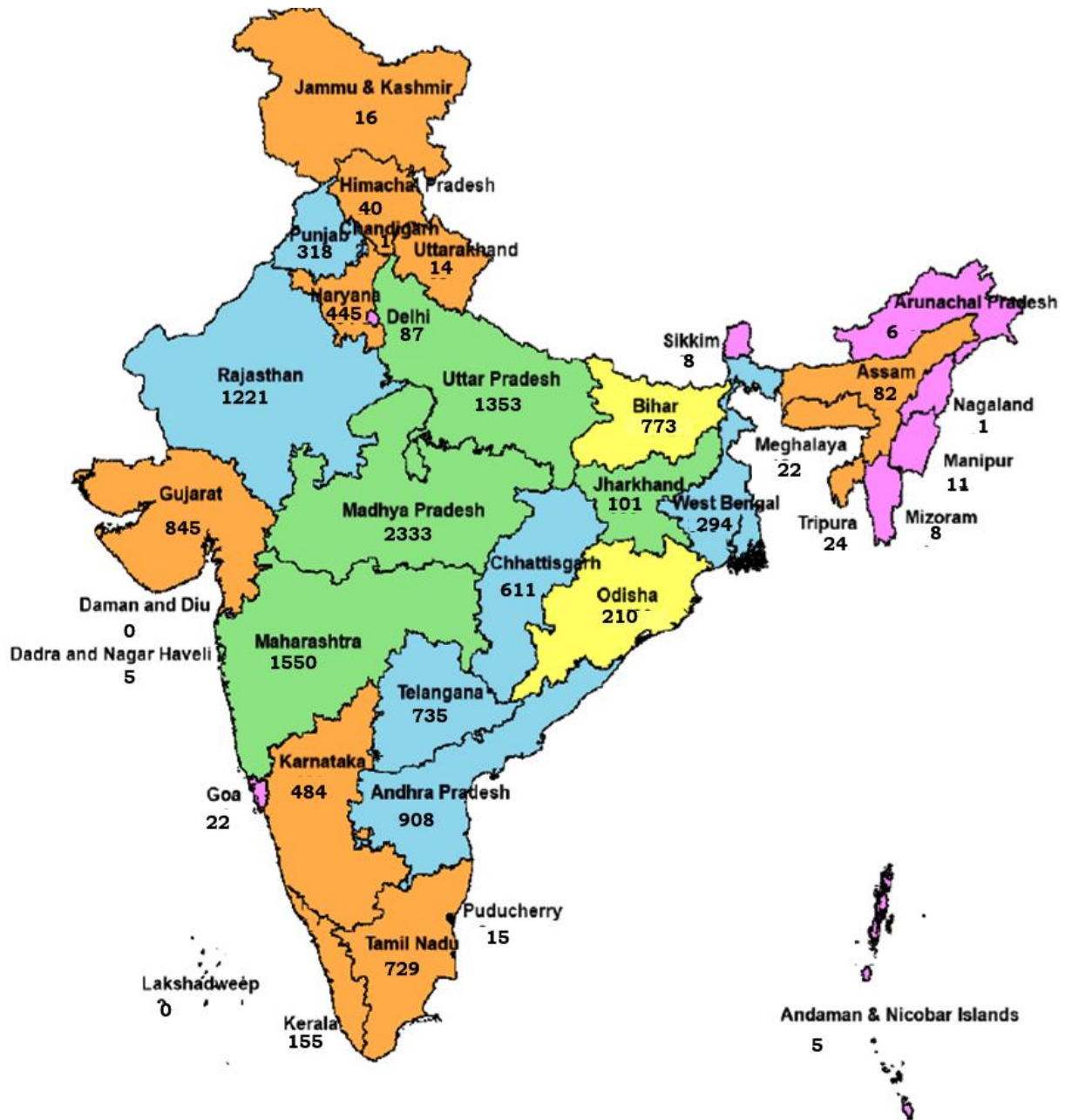
Fig. 1: State & Union territory wise death due to Electrical Accidents in India

Workplace Electrical accidents report nearly 13 electrocution fatalities on an average day in India. This is the highest in the world. The yearly average of electric-related deaths in workplaces in the United Kingdom and the United States is 8 and 82 respectively. The Central Electricity Authority (CEA) data shows nearly 40% of deaths at the workplace due to electrical issues.