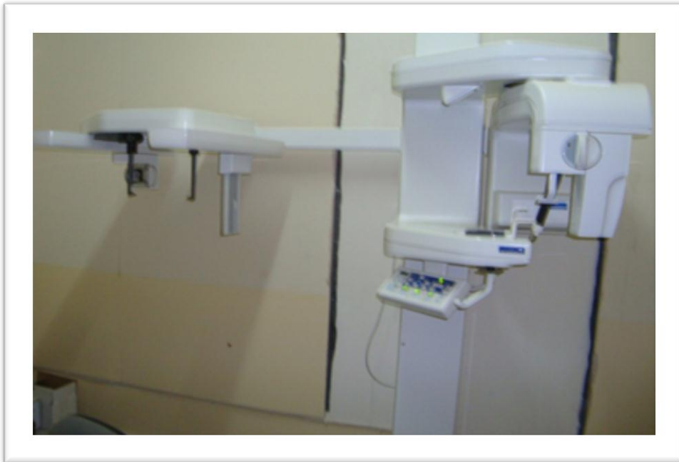
Figure (1) Digital Cephalometric Machine