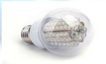
Fig. 1 An LED bulb that work as a Li-Fi adaptor