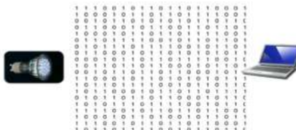
Fig.2. How the data will be transmitted

Li-Fi, as it has been dubbed, has already achieved blisteringly high speeds in the lab. Researchers at the Heinrich Hertz Institute in Berlin, Germany, have reached data rates of over 500 megabytes per second using a standard white-light LED. Haas has set up a spin-off firm to sell a consumer VLC transmitter that is due for launch next year. It is capable of transmitting data at 100 MB/s – faster than most UK broadband connections. In October 2011 a number of companies and industry groups formed the Li-Fi Consortium [4] , to promote high-speed optical wireless systems and to overcome the limited amount of radio-based wireless spectrum available by exploiting a completely different part of the electromagnetic spectrum. The consortium believes it is possible to achieve more than 10 Gbps, theoretically allowing a high-definition film to be downloaded in 30 seconds.