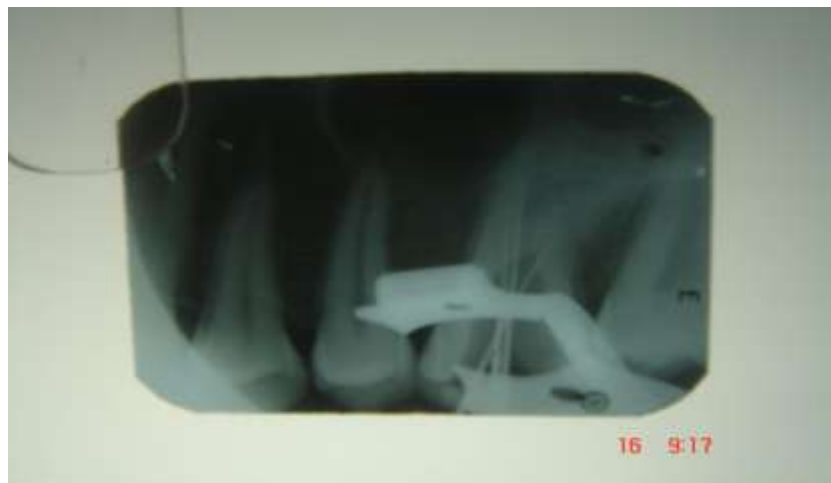
Fig. 4: working length