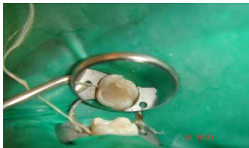
Fig. 6: reinforcing with fibre reinforced composite

From these radiographic findings, the tooth was diagnosed to be a hypertaurodont (Shifmann and Chanannel classification). The treatment was started with administration of local anesthesia using 2% lidocaine hydrochloride with 1:200,000 adrenaline. Tooth was isolated using rubber dam and caries removed prior to access opening. The pulp was voluminous and extirpated from pulp chamber using 60 size 'H' file. To ensure complete removal, 2.5% sodium hypochlorite was initially used as an irrigant to soften the pulp. Once the pulp was extirpated, further irrigation was done with normal saline, 3% of hydrogen peroxide and 2.5% of sodium hypochlorite. The pulp chamber was huge and the floor of the chamber could not be visualized. At the furcation area, using operating microscope, three canal orifices were located: palatal, mesiobuccal and distobuccal. A working length radiograph was taken with a #15 file in the canal and it was confirmed by an electronic apex locator (Root ZX; Morita, Japan) .