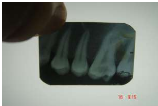
Fig. 1: Pre Operative

In 1928, Shaw classified teeth as cynodont, hypotaurodont, mesotaurodont and hypertaurodont, in terms of increasing degree of severity of apical displacement of the pulp chamber floor (Figure 1).