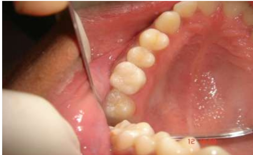
Fig. 7: final restoration

The three canals were thoroughly instrumented using nickel titanium rotary technique and apical preparation to a size of 25 with 4% K3 (Sybron Endo, Orange, CA, USA) in both buccal canals and to a size 40 with 6% K3 (Sybron Endo, Orange, CA, USA) in palatal canal was done using torque control motor (EX-Smart, DENSPLY). The huge pulp chamber walls were planed circumferentially using 60 size 'K' files of standard ISO taper. Sterile saline was used as the final irrigant and ultrasonic irrigation was done. Canals were obturated with corresponding GP points (Sybron Endo, Orange, CA, USA).