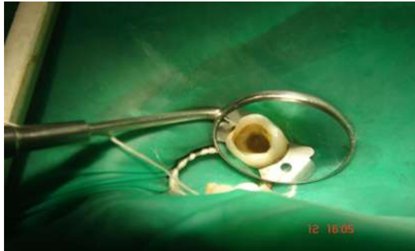
Fig. 3: clinical picture

‘Taurodont index’ relating the height of the pulp chamber to the length of the longest root was proposed by Keene in 1966. Blumberg believed that taurodontism is a continuous trait and therefore cannot be put into strict categories (Blumberg 1971). He proposed several variables in a biometric study. Shifman and Chananel established more objective criteria on the basis of determined measurement of the tooth. A tooth is taurodont when the distance from the lowest point of pulp chamber roof to the highest point of the floor divided by the distance from the lowest point of pulp chamber roof to root apex is 0.2mm or greater and of distance from the highest point of the floor to cemento enamel junction greater than 2.5mm. Taurodontism though not common, is an important occurrence that may influence the dental management of patients. Clinical considerations related to it are, susceptibility to root resorption during orthodontic treatment, extractions are more difficult as furcation is located more apically and root apices may be shorter and thinner, anchorage value of teeth may be reduced.