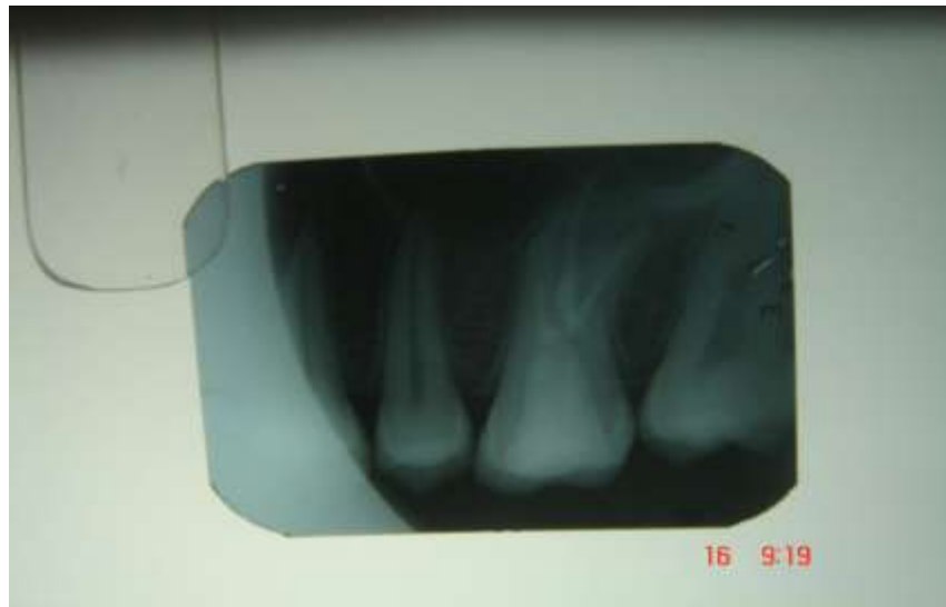
Fig. 5: post obturation

From these radiographic findings, the tooth was diagnosed to be a hypertaurodont (Shifmann and Chanannel classification). The treatment was started with administration of local anesthesia using 2% lidocaine hydrochloride with 1:200,000 adrenaline. Tooth was isolated using rubber dam and caries removed prior to access opening. The pulp was voluminous and extirpated from pulp chamber using 60 size 'H' file. To ensure complete removal, 2.5% sodium hypochlorite was initially used as an irrigant to soften the pulp. Once the pulp was extirpated, further irrigation was done with normal saline, 3% of hydrogen peroxide and 2.5% of sodium hypochlorite. The pulp chamber was huge and the floor of the chamber could not be visualized. At the furcation area, using operating microscope, three canal orifices were located: palatal, mesiobuccal and distobuccal. A working length radiograph was taken with a #15 file in the canal and it was confirmed by an electronic apex locator (Root ZX; Morita, Japan) .