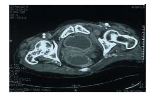
Figure 1 Abdominal CECT showing dilatation of gut loops. Figure 1 Abdominal CECT Showing herniated small bowel in left obturator canal